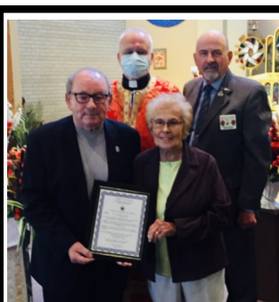
Holy Family Parish Sunday, September 13, 2020

Sign up for the debit Program. Forms are on the website under "forms", also available in the narthex