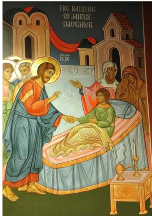
Icon of Jesus resurrecting Jairus' daughter